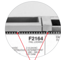
Saw-Tooth Adjustment Locator 1